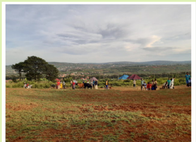
View from the permanent location of 'Philly's Place'